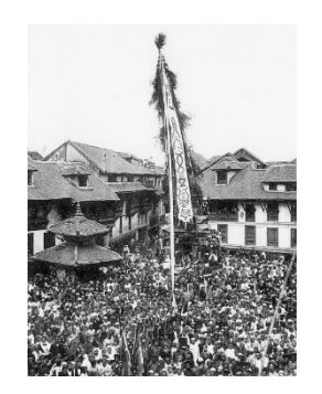
11/6. Class 9: Samyak, Ratha Jatra-s

Films: "Samyak 1993" and "On the road with the Red God"